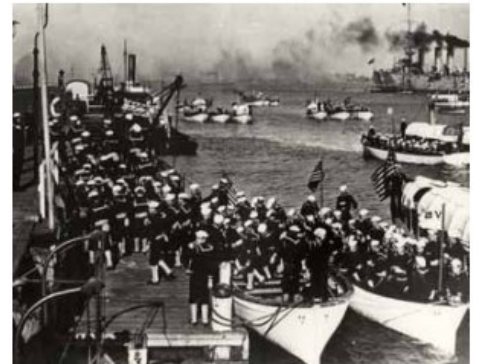
US Navy bluejackets coming ashore at Melbourne 29 August 1908. (US Naval Historical Center)

Sea Power Centre - Australia Department of Defence